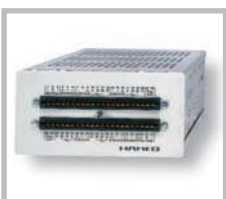
Test adapter HZ809

Mainframe HM8001-2 or HM8003 required for operation